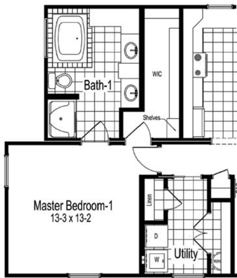
Alternate #1 Floor Plan